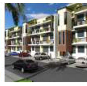
Riverdale Maya Greens