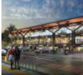
Riverdale Business Plaza Riverdale Business Center